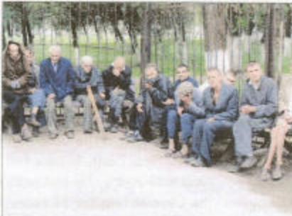
Some of the men in the cage... And one young man who will spend his life in this bed...