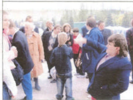
God's special kids going to the circus!!

We visited this place on a Saturday and had the privilege to take 11 of the more mobile residents to the Moscow Circus in the afternoon. They were just little kids, so excited to get