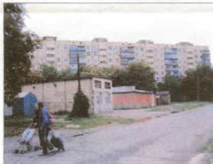
THE APARTMENT BUILDING WE LIVED IN